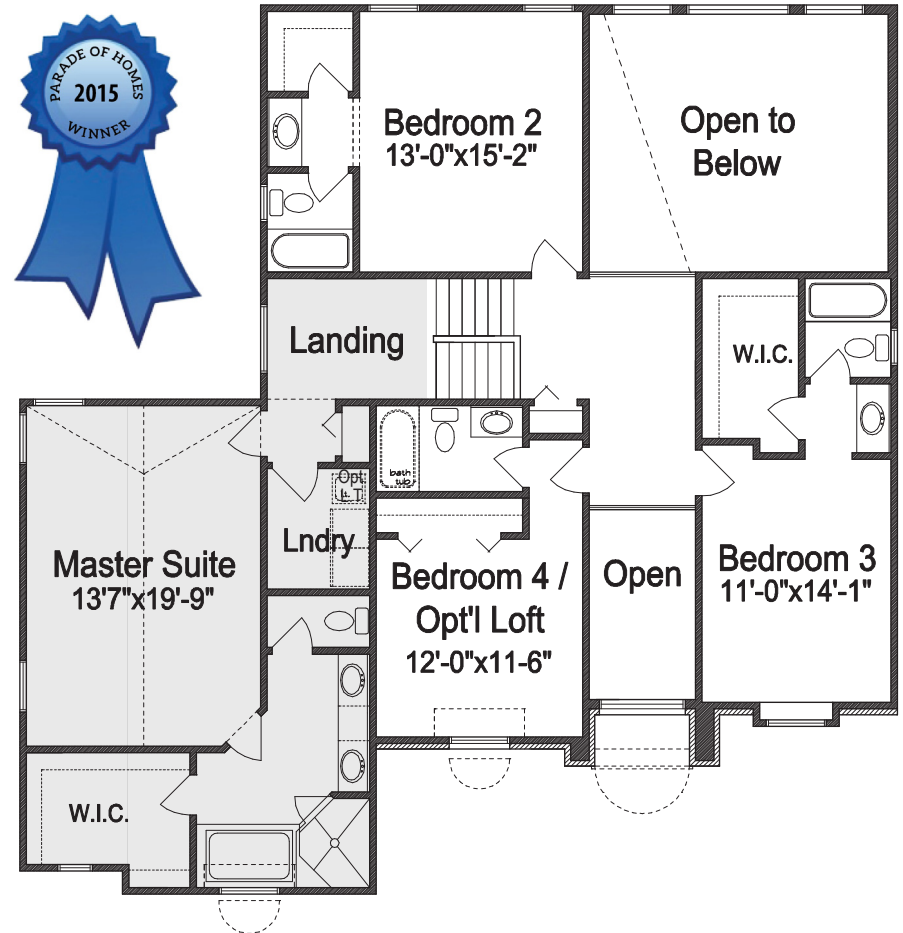
MASTER SUITE & UPPER LEVEL FLOOR PLAN